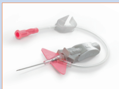
BD Nexiva™ Single port