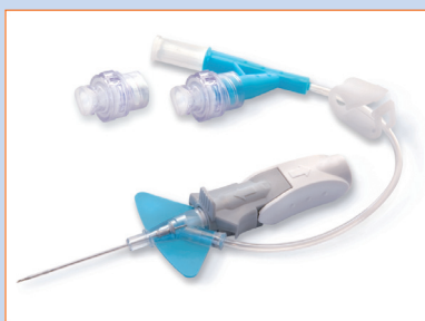
BD Nexiva™ Dual port with 2 x BD Q-Syte™